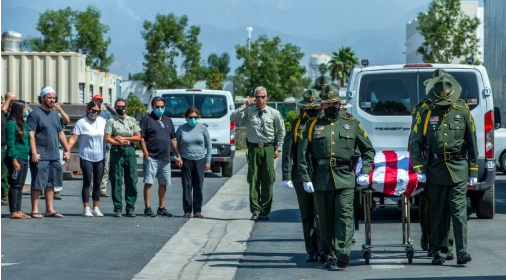
Family members watch as the body of a firefighter killed fighting the El Dorado fire is walked into the San Bernardino County Coroner's Office by San Bernardino Sheriff's Honor Guards in San Bernardino on Friday, September 18, 2020.