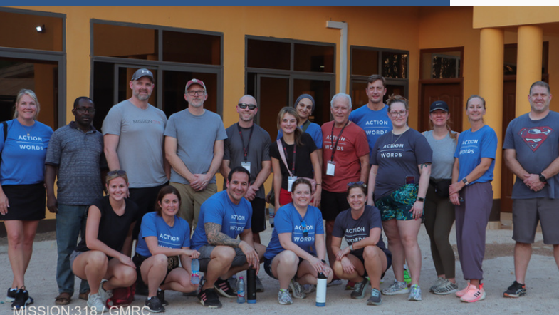
MISSION:318 / GMRC

“...Let us not love with words or speech but with actions and in truth.” 1 John 3:18